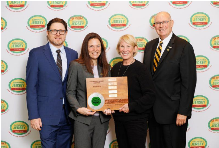
Sustainable Jersey Bronze Certification