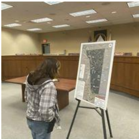
Beagle Club Concept Design Meetings and Recommendations