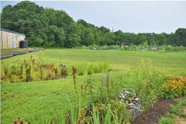
Supported Green Infrastructure Work