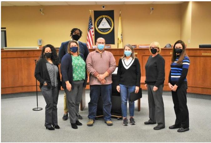
Community Impact Award