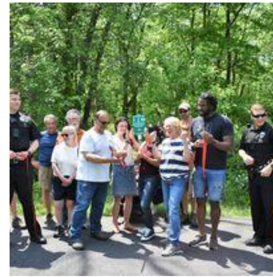
New Road Trail Opening