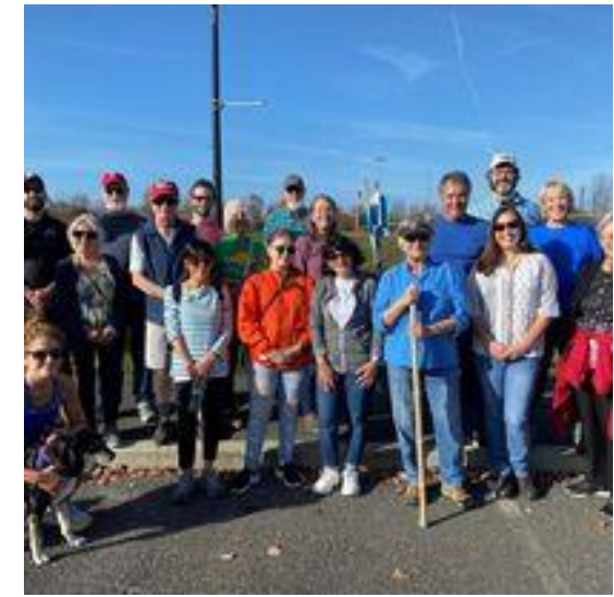
New Road Trail Guided Hike