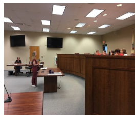
Student gives her voice on a proposed motion

By joining Y.A.C., individuals can receive internship, service hours, and civic engagement opportunities.